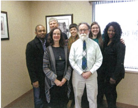
North Quabbin CAPE Team - March 2016; (left to right)